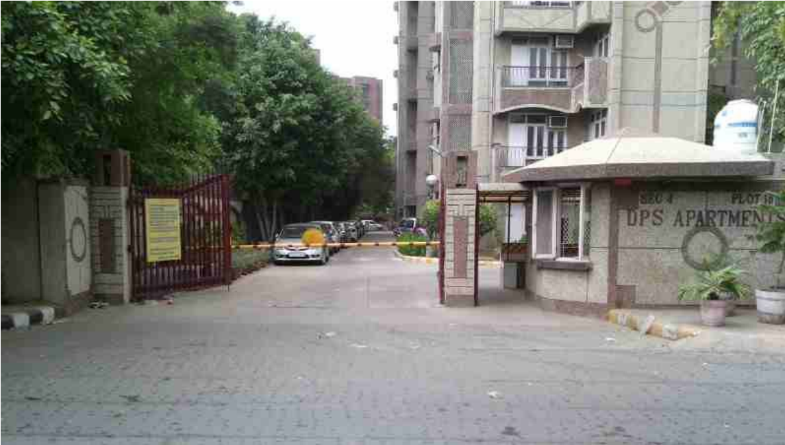
Illegal car parking at a housing society in Dwarka can cause fire mishaps.

The MC members of the cooperative group housing societies have to deal with various government departments to run the society affairs. However, the RCS office of the Delhi Government is responsible to ensure corruption-free environment in the societies and protect the rights of residents.