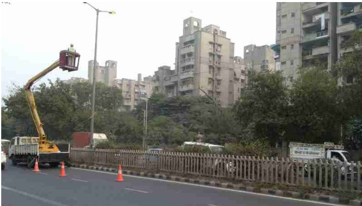
Cooperative group housing societies in Delhi

If the government wants to stop the rising tide of corruption, it must take strict action against such employees who have become part of the racket and support illegal activities in housing societies.