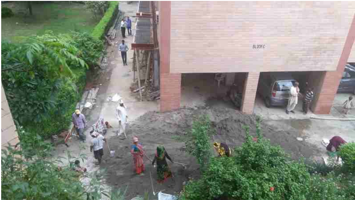
Deadly dust and noise pollution is caused by illegal construction in a cooperative group housing society of Dwarka, New Delhi

As corruption is rampant, the MC office bearers are always eager to make a fast buck and spend individual members' money unscrupulously without taking proper approvals. They also plan and execute unnecessary (and sometimes illegal) high-value construction projects within the society buildings without following the proper approval and expenditure norms.