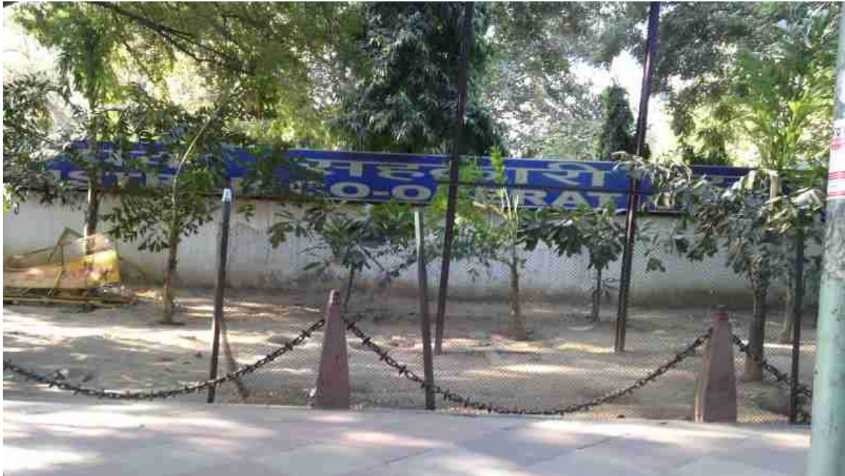
Office of the Registrar Cooperative Societies (RCS) of Delhi Government

The report reveals massive corruption and illegal activities in Delhi's Cooperative Group Housing Societies (CGHS) which are supposed to be regulated by the Delhi Government.