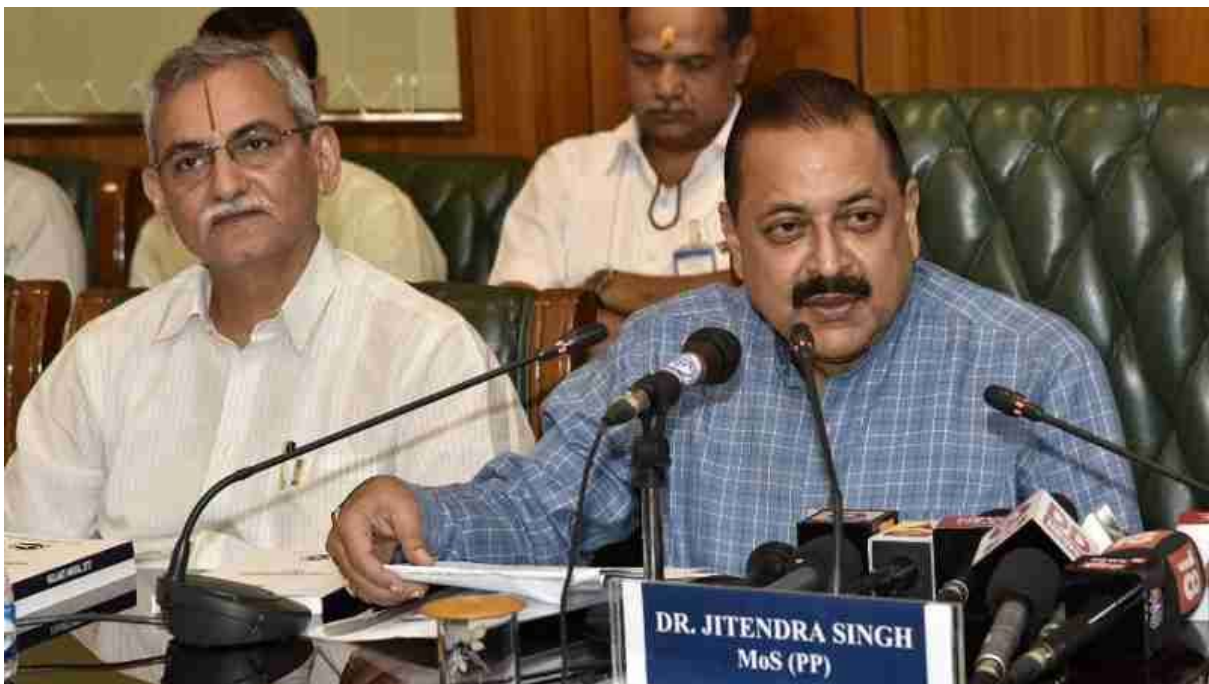
Indian Minister Dr. Jitendra Singh releases Vigilance Manual 2017.

While corruption is happening openly, most corruption cases involving top bureaucrats and politicians do not get reported. As most Indian journalists are corrupt, Indian media is under the tight control of the government. When some corruption cases appear in the non-traditional media (such as news sites), government ignores them and makes false claims that no corruption is happening under the government. The truth, however, is that corruption - which has been persisting for decades under all governments - is happening at every step in the country.