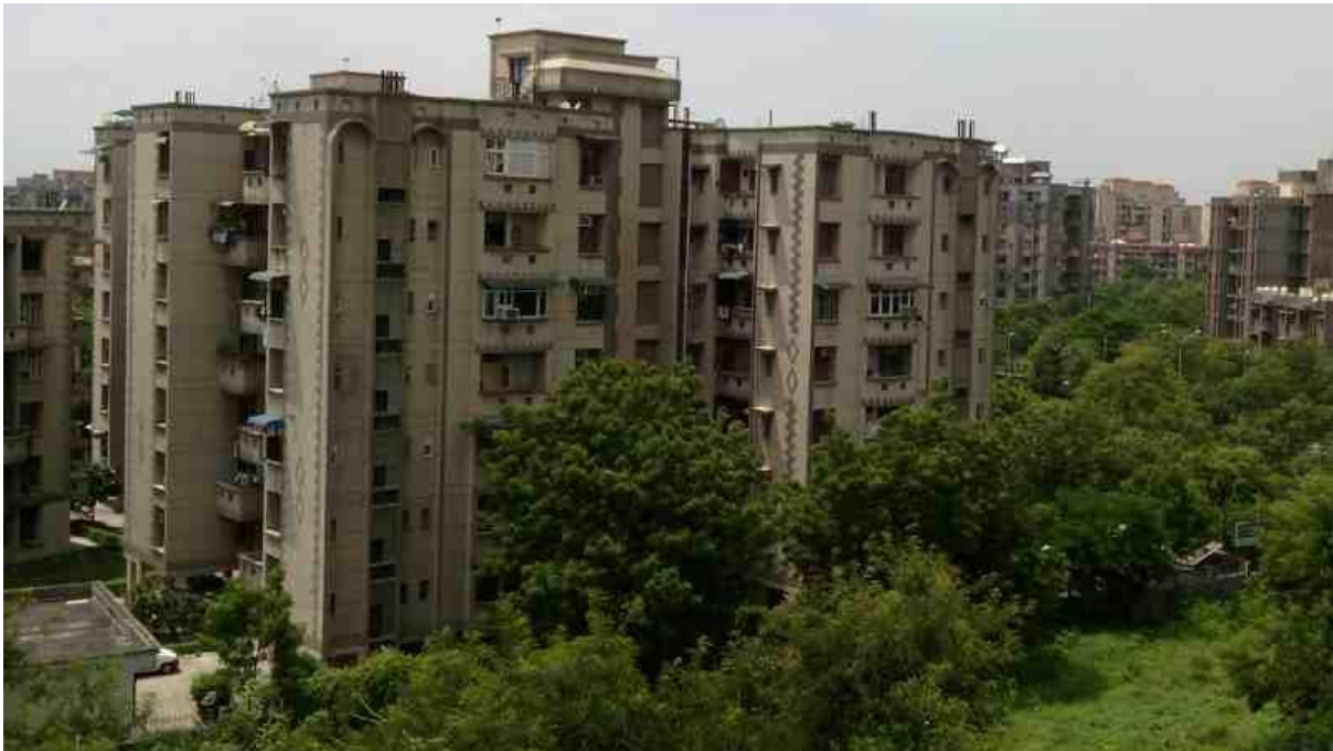
Cooperative group housing societies in Delhi

While Mahatma Gandhi believed that cooperative societies are ideally suited organizations for development in the villages, he floated the ' Gram Swaraj ' concept. In the post-independence era, however, India replicated Gandhi's cooperative model in urban areas also.